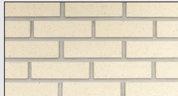
Ivory - Velour Texture - 836772

thinBRIK greatly enhance a commercial building's exterior façade at a competitive price. Ask your Acme Brick representative for current inventory.