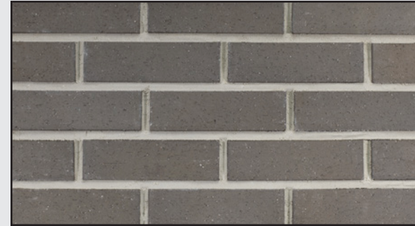
Obsidian - Velour Texture - 836775