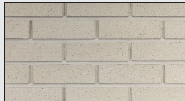
Pikes Peak - Velour Texture - 836773