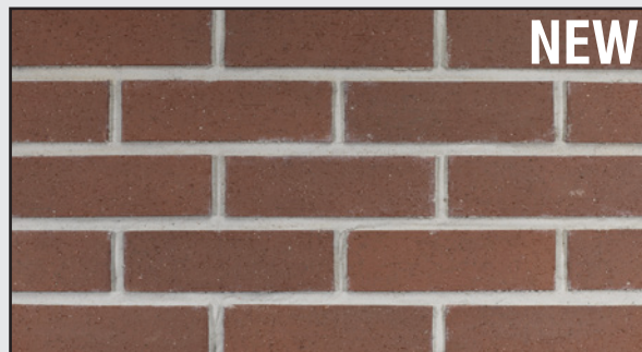
Reeves Park - Velour Texture - 839044