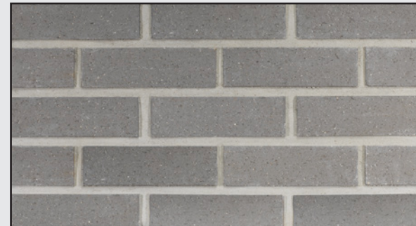
Rushmore - Velour Texture - 836774