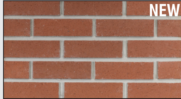
Mesa Red - Velour Texture - 839045