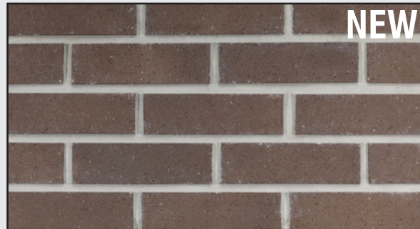
Dickens Creek - Velour Texture - 839043