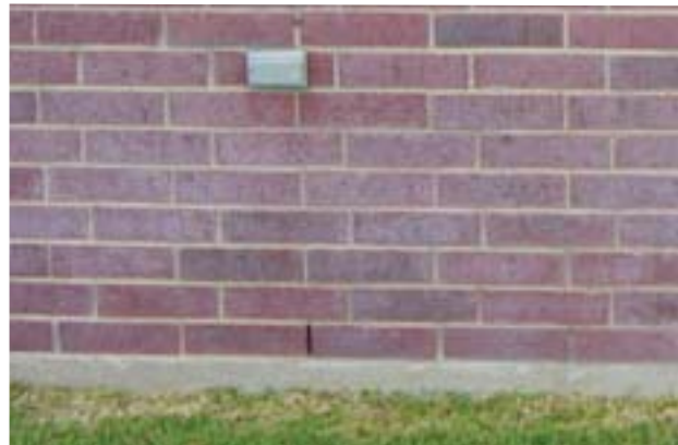
Photo 14 Hard Water Stain