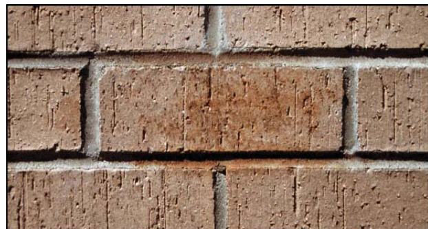
Photo 10 Manganese Stain