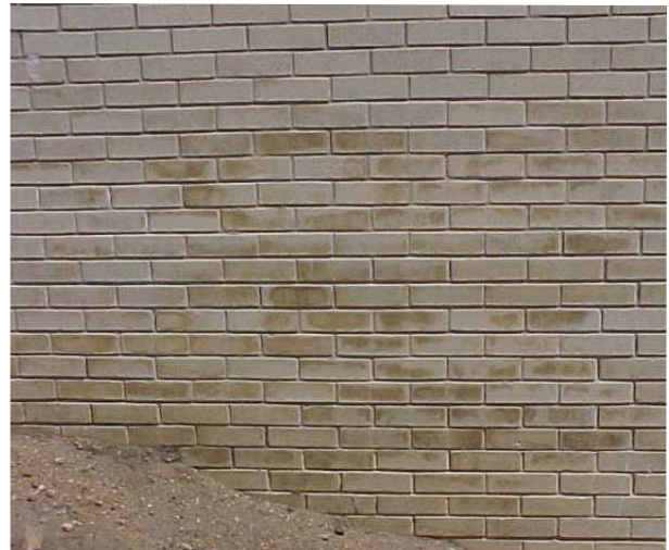
Photo 7 Yellow Vanadium Stain