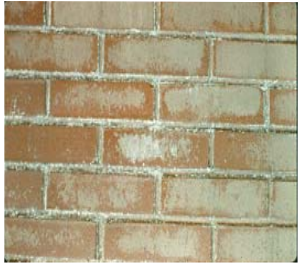
Photo 6 White Scum