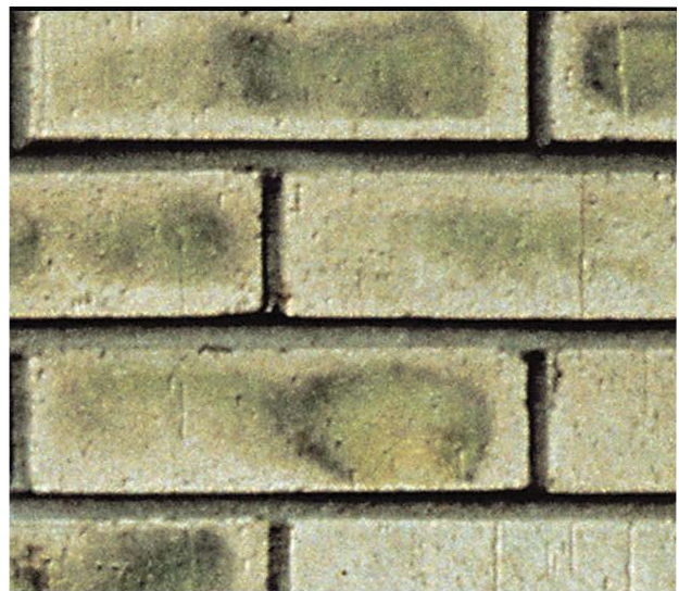
Photo 8 Green Vanadium Stain