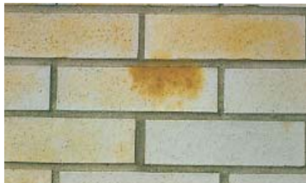
Photo 15 Rust Stain