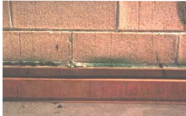
Photo 12 Stain from Copper