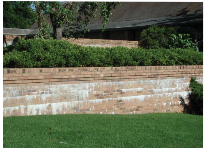
Photo 4 Lime Run

Silicate deposits, sometimes referred to as “white scum,” usually appear as white or gray discolorations on the face of brick masonry, as shown in Photo 6 . The discoloration may be present over the entire face of the brickwork or in smaller, irregularly shaped areas. White