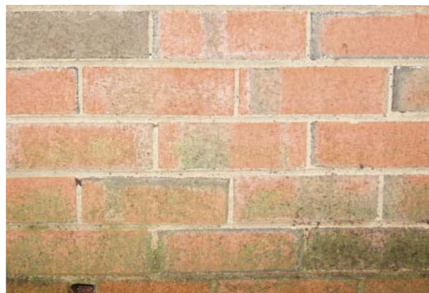
Photo 11 Organic Stain