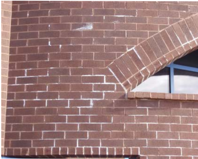
Photo 2 Efflorescence on Mortar Joints