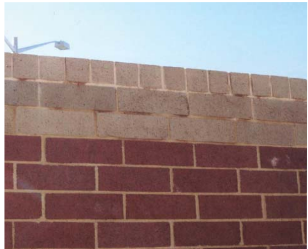
Photo 9 Manganese Stain

Rust-colored stains may actually be corrosion, as shown in Photo 15 . Such stains can be the result of