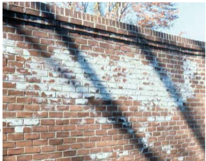
Photo 1 Efflorescence

Efflorescence is usually white in color; however, all white stains on brick masonry are not necessarily efflorescence. Lime run and white scum, as discussed below, are occasionally mistaken for efflorescence.