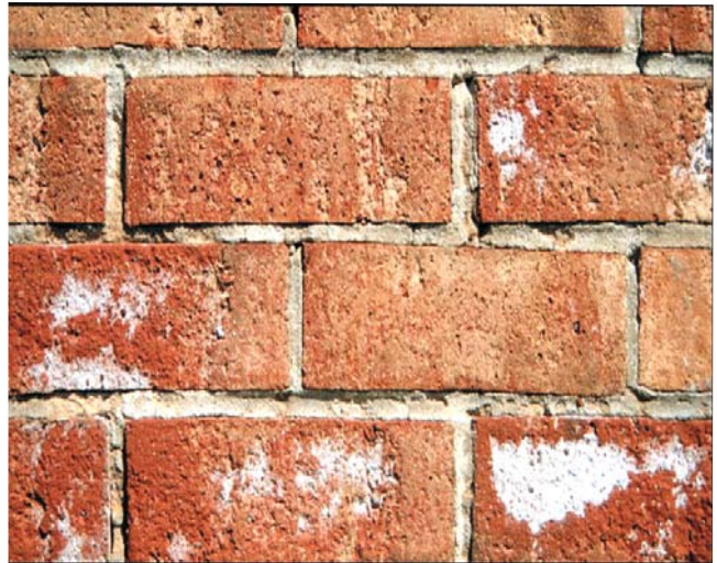
Photo 3 Efflorescence in Limited Areas